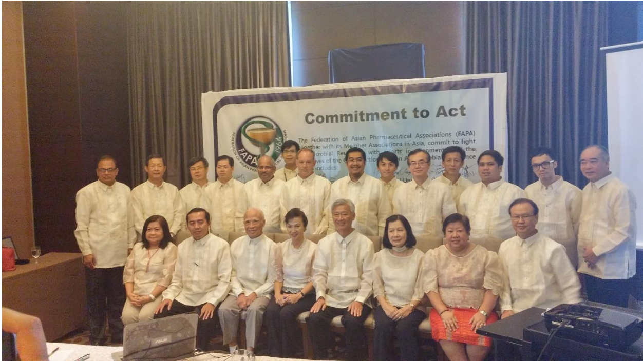
FAPA Leader’s Meeting in the Fight against Antimicrobial Resistance: A Committeemen to Action attended (September 12 th , 2015)