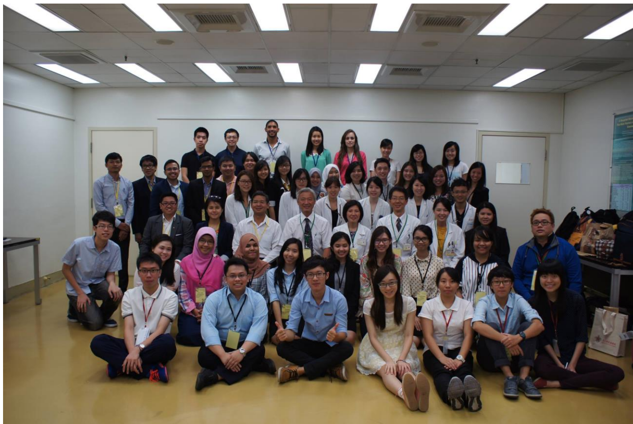
2015 4 th GPP International Training Programme (all trainees) at Taipei Veterans General Hospital

For being a better FAPA, our FAPA Foundation keeps hosting Good Pharmacy Practice international training programme for the 5 th years, and we've trained nearly 100 Asian pharmacists from around 20 countries; furthermore, we also hosted Community Pharmacy Workshop in Fukuoka, Japan and invited member associations to join in the community pharmacy fieldtrips, which 10 member associations joint with us this year.