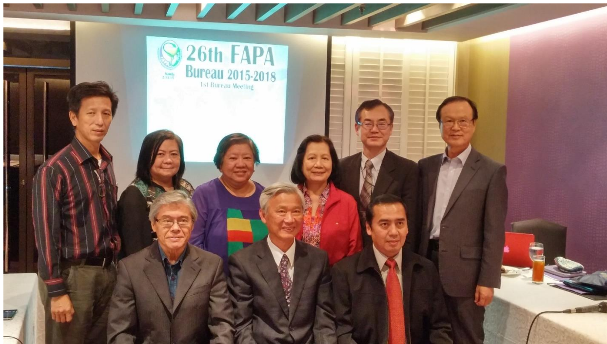
14 th FAPA Bureau in the 1 st FAPA Bureau Meeting, 2015.

In my inauguration speech, I shared my three targets to all the congress participants as we open a new decade for FAPA. The first is, we will make FAPA – Bigger! Second, we will make FAPA – Better! And third, we will make FAPA – Stronger! Together with our FAPA family, I believe we’ve achieved much progress in witnessing all these happening.