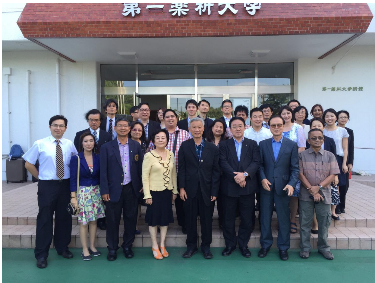
2016 1 st FAPA Community Pharmacy Workshop in Fukuoka, Japan

For being a stronger FAPA, we've officially visited WHO-WPRO, and WHO-EMRO since last year; and we also have many communication with WHO-SEARO; we've not only contacted those WHO regional offices, we also proposed and hosted Antimicrobial Resistance Campaign in echoing WHO's Antibiotic Awareness Week (2015), which we've invited all FAPA member and presidents to join in the seminar held in last September (Manila, Philippines) and we all signed on the commitment to fight against antimicrobial resistance; Other FAPA campaigns, including Twibbon® campaign, 4-frame Comic Competition and etc, were all successfully supported by our member associations, including IPA.